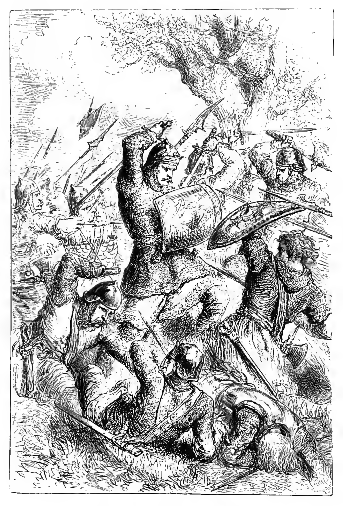
King Alfred at the Battle of Ashdown .- P. 76.