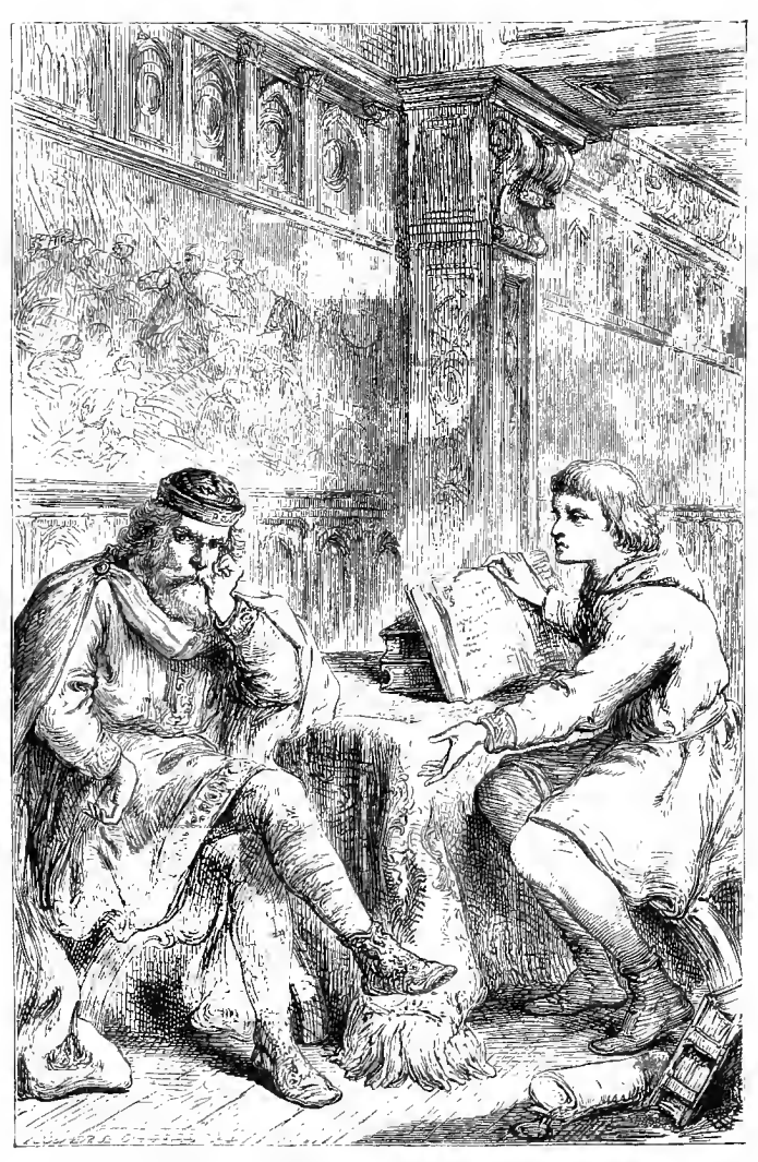
Schulously bent on acquiring learning.-P. 177.