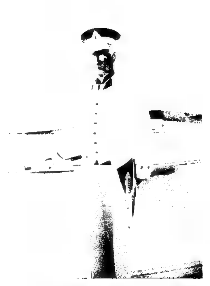
A Monsieur Raymond Poincaré, Président du Conseil des Ministres, de la part d'Édouard Prince de Galles, en souvenir de son séjour à Paris en 1912.