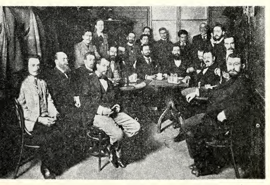
Conference for the founding of Die Welt in the Café Louvre, Vienna (February, 1897).