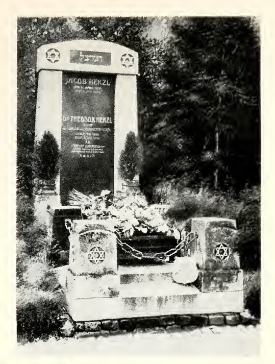
Herzl's tomb in Vienna.