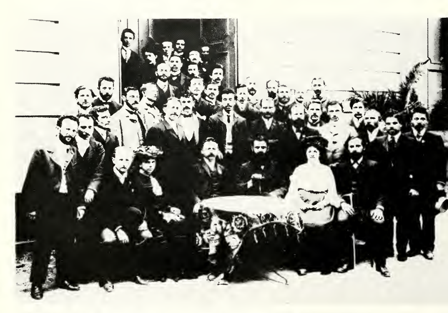
Herzl with journalists at the Sixth Zionist Congress, Basle (1903). The author (in light waistcoat), then twenty-four years old, is standing just behind Herzl.