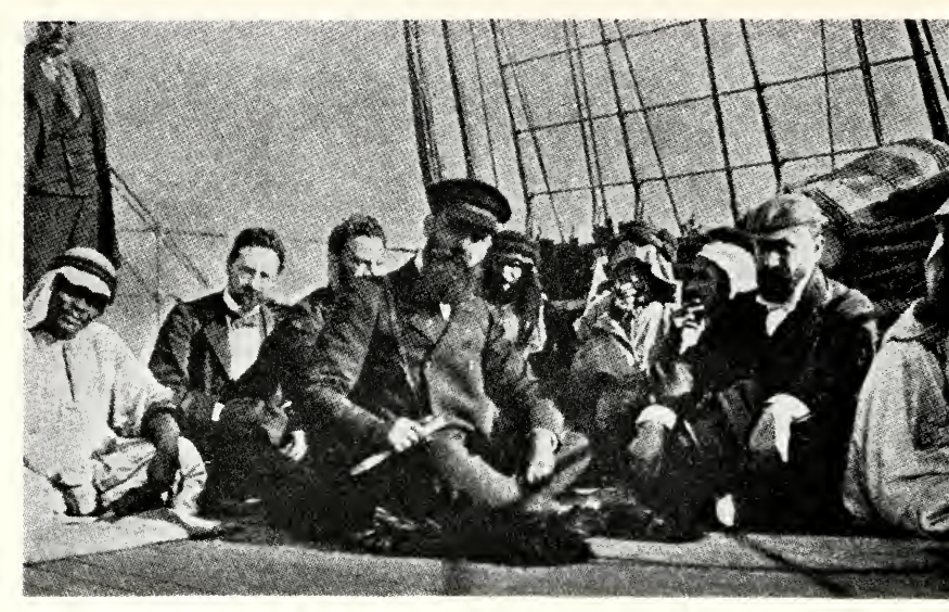
Herzl with a Zionist delegation sailing to Palestine.