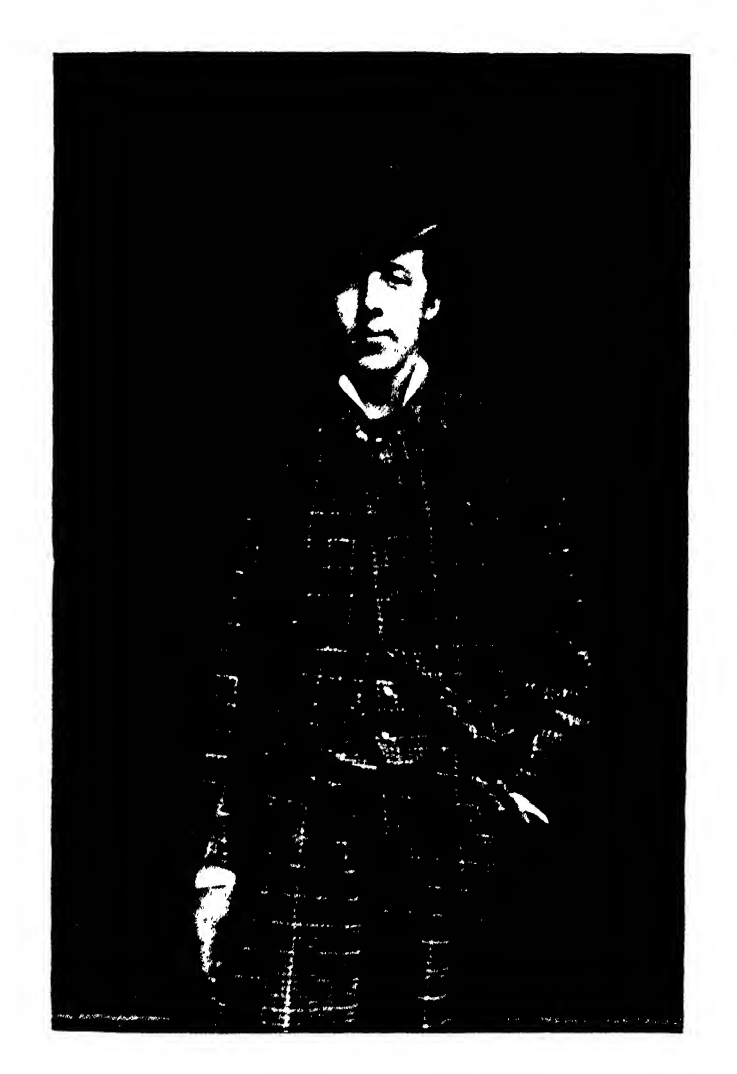
OSCAR WILDE AT OXFORD