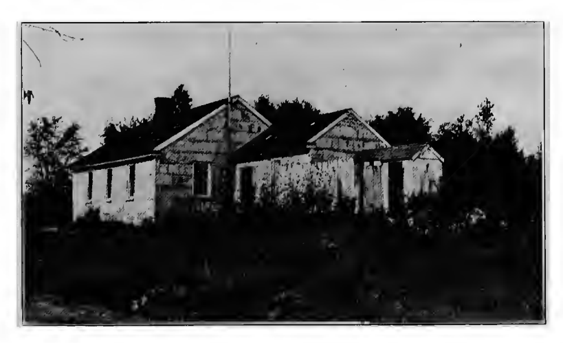
STONE SCHOOLHOUSE WHERE SHE FIRST TAUGHT