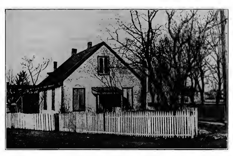
THE SCHOOLHOUSE AT BORDENTOWN