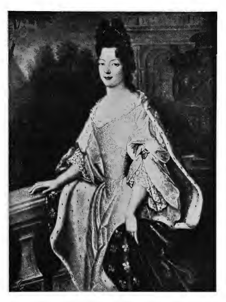
MARIE ADÉLAIDE OF SAVOY, DUCHESSE DE BURGOGNE FROM A PAINTING ATTRIBUTED TO SANTERRE, IN THE PALA/ZO REALE, TURIN