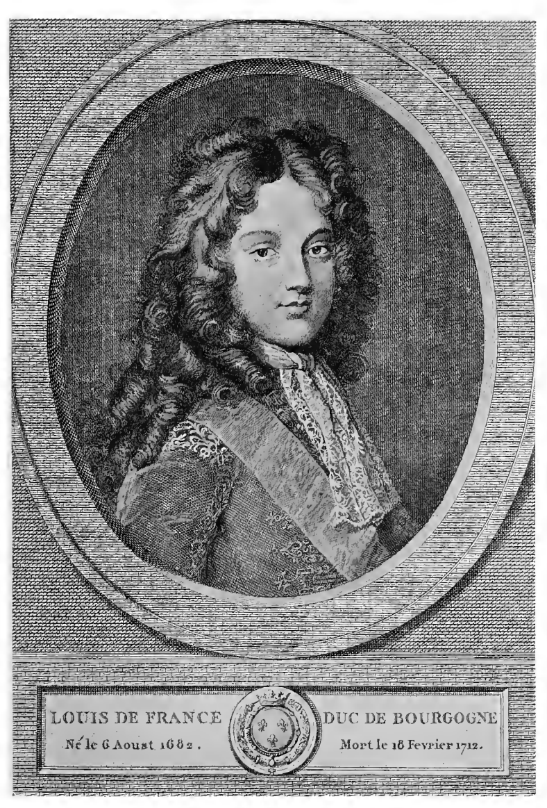
LOUIS DE FRANCE, DUC DE BOURGOGNE FROM A CONTEMPORARY PRINT