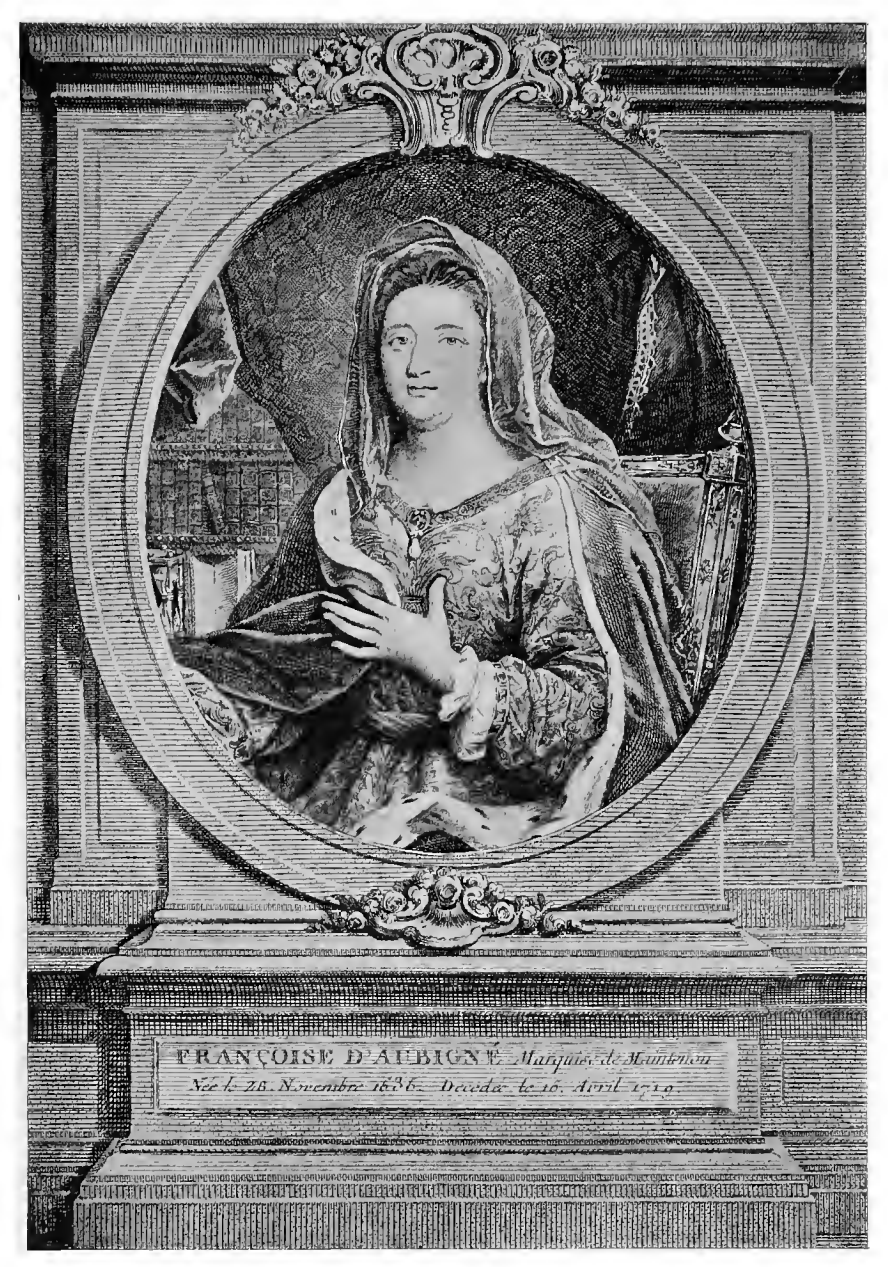
FRANÇOISE D'AUBIGNÉ, MARQUISE DE MAINTENON FROM AN ENGRAVING AFTER THE PAINTING BY MIGNARD