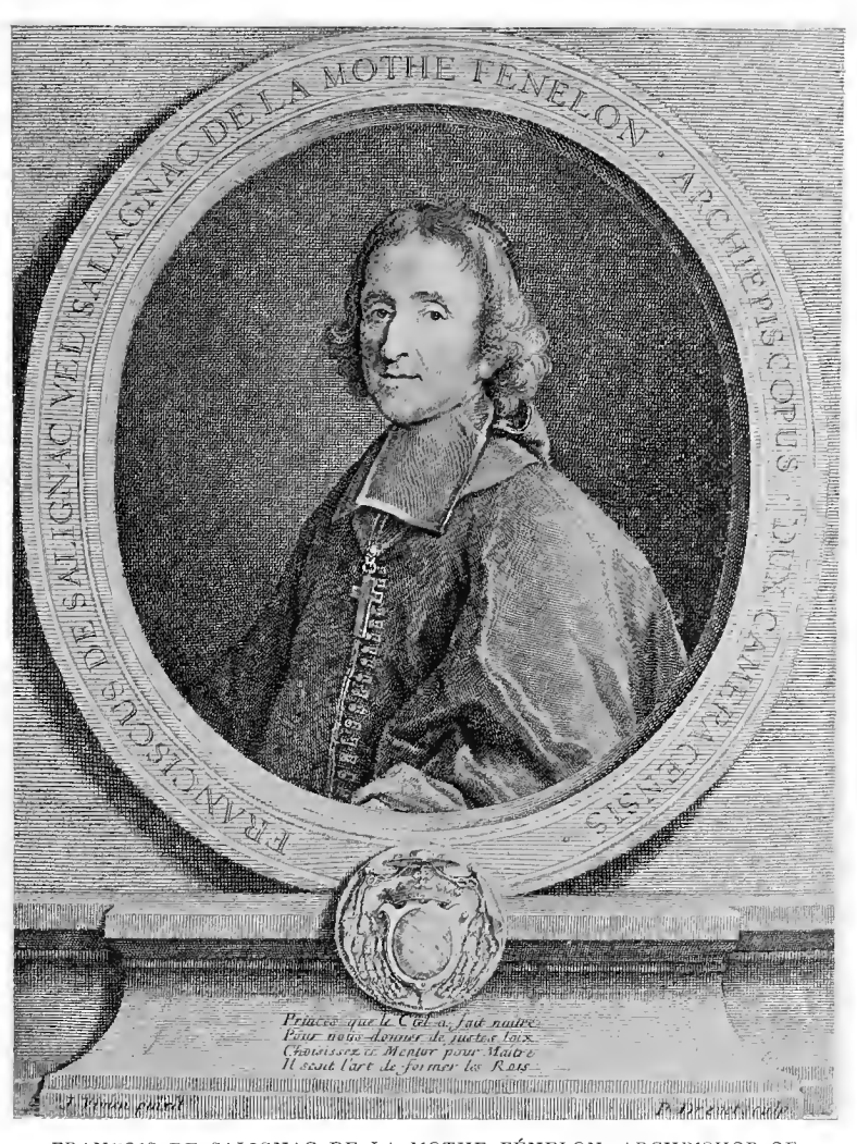
FRANÇOIS DE SALIGNAC DE LA MOTHE FÉNELON, ARCHBISHOP OF CAMBRAI

FROM AN ENGRAVING BY DREVEF, AFTER THE PAINTING BY VIVIEN