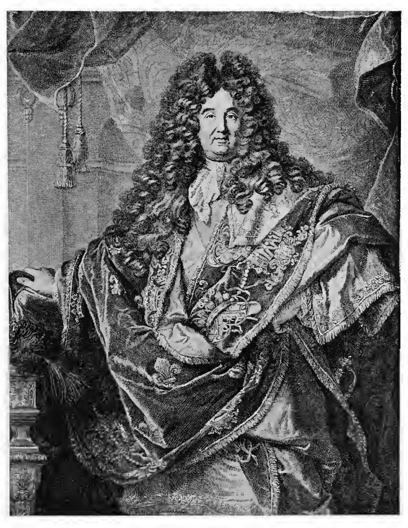
PHILIPPE DE COURCILLON, MARQUIS DE DANGEAU FROM AN ENGRAVING BY DREVET, AFTER THE PAINTING BY RIGAUD