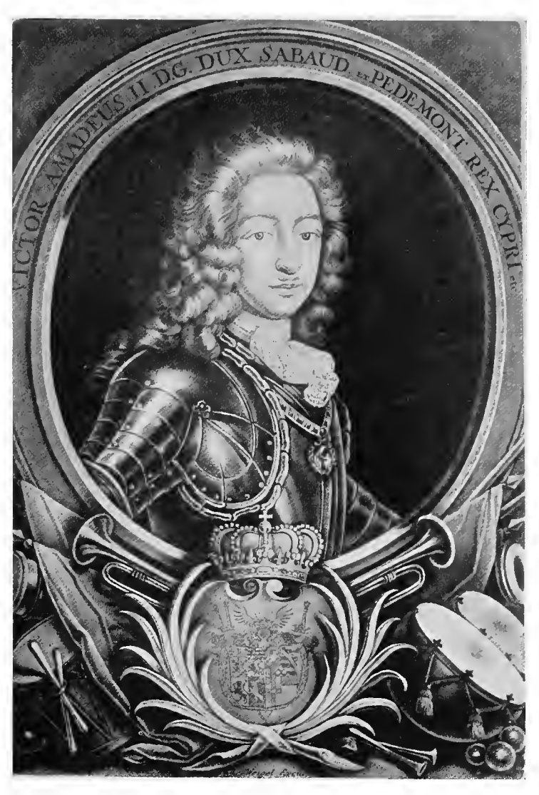
VICTOR AMADEUS II, DUKE OF SAVOY FROM A CONTEMPORARY PRINT