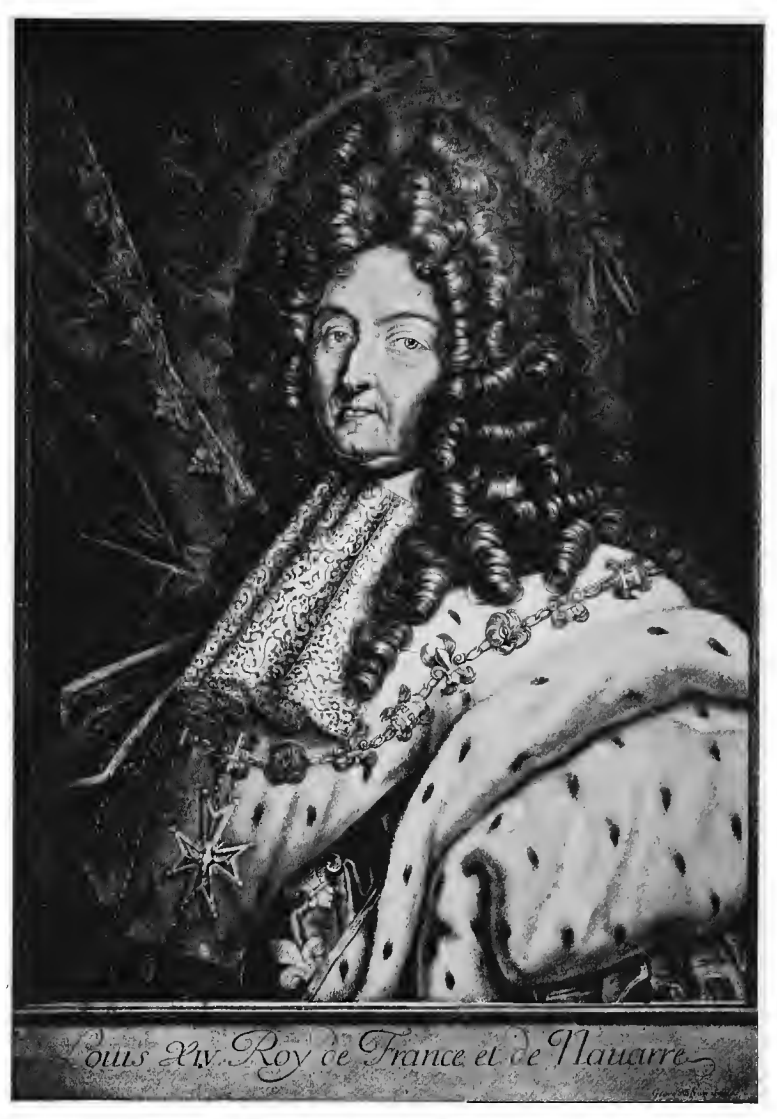
{\bf LOUIS~XIV} \\ From an engraving after the painting by fiter