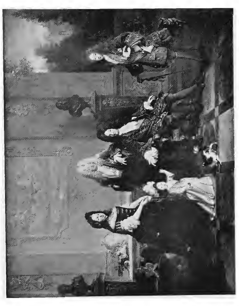
LOUIS XIV, WITH MADAME DE MAINTENON, THE GRAND DAUPHIN, THE DUC DE BOURGOGNE. AND THE DUC D'ANJOU (AFTERWARDS LOUIS XV)

FROM THE PAINTING BY LARGILLIÈRE, IN THE WALLACE COLLECTION, AT HERTFORD HOUSE