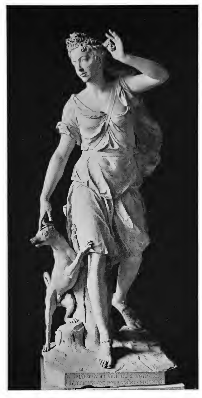
MARIE ADÉLAÏDE OF SAVOY, DUCHESSE DE BOURGOGNE, AS DIANA FROM THE STATUE BY COYZEVOX IN THE LOUVRE