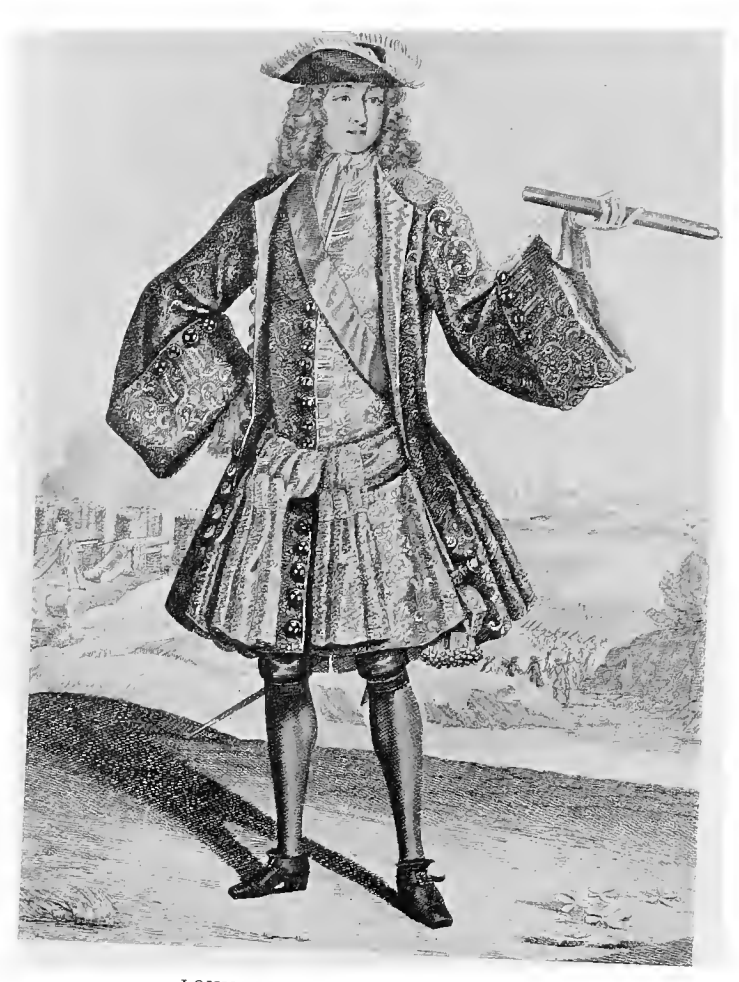
LOUIS JOSEPH, DUC DE VENDÔME FROM A CONTEMPORARY PRINT