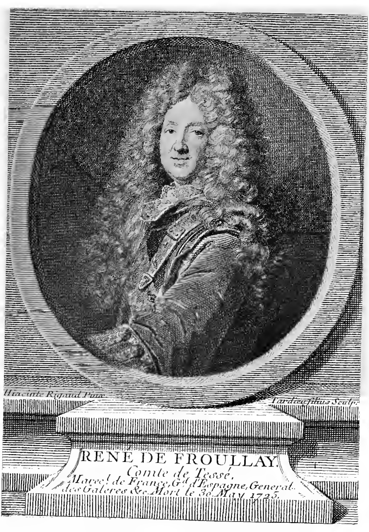
RENÉ DE FROULLAY, COMTE DE TESSÉ FROM AN ENGRAVING BY TARDIEU FILS, AFTER THE PAINTING BY RIGAUD