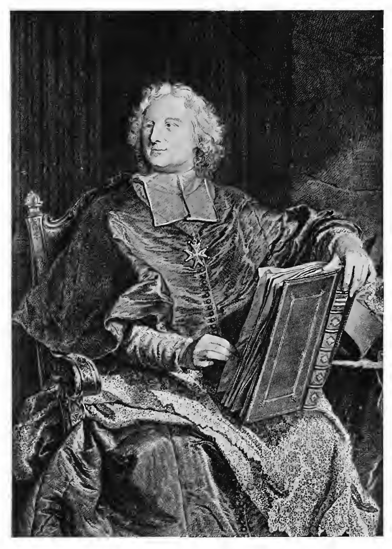
ABBÉ (AFTERWARDS CARDINAL) MELCHIOR DE POLIGNAC FROM AN ENGRAVING BY DAULLÉ, AFTER THE PAINTING BY HYACINTHE RIGAUD