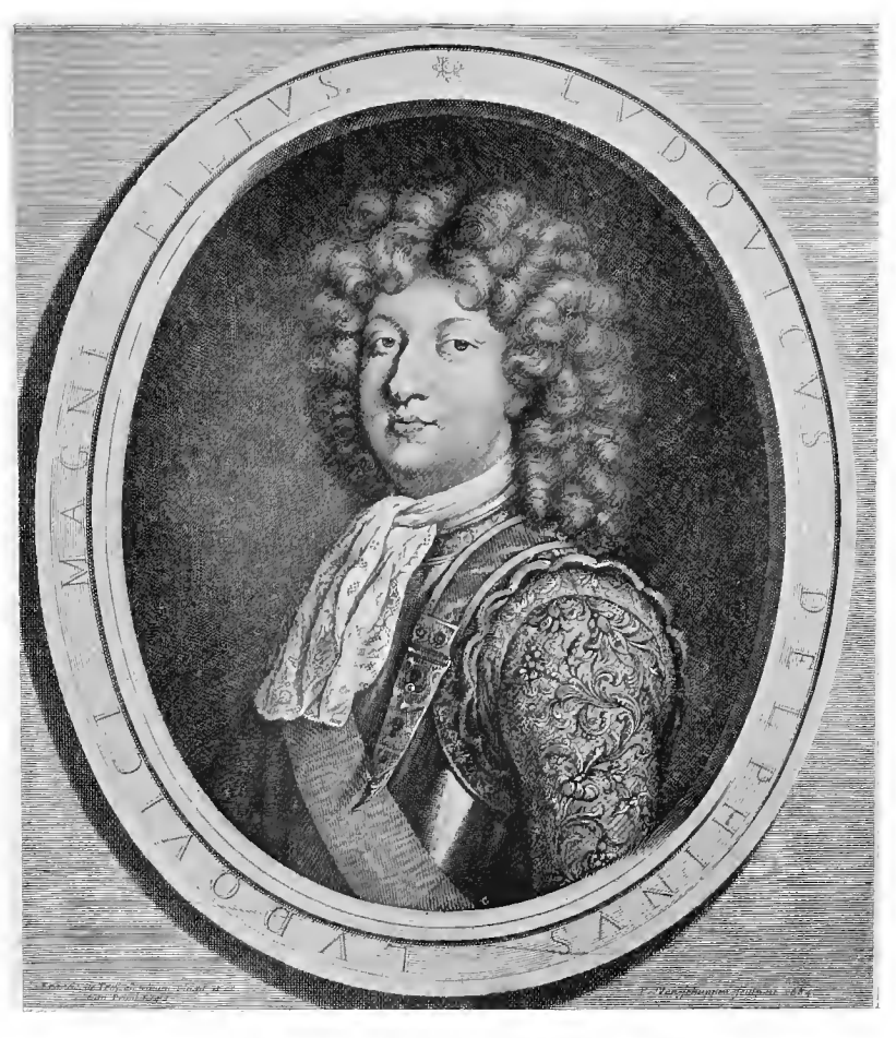
LOUIS, DAUPHIN OF FRANCE (SON OF LOUIS XIV) FROM AN ENGRAVING BY VAN SCHUPPEN, AFTER THE PAINTING BY FRANÇOIS DE TROV