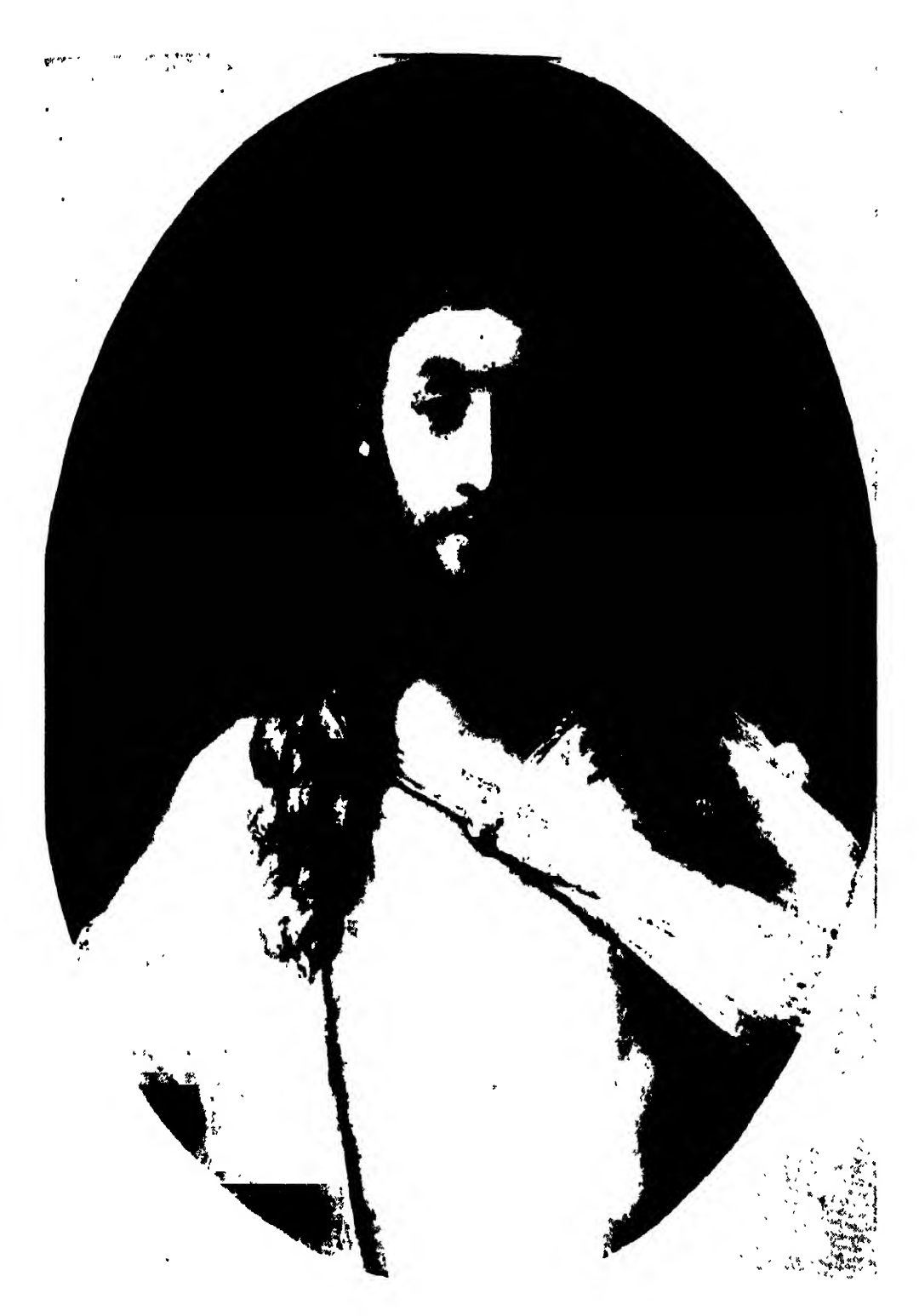
CHRIST 1661. Munich, Altere Pjinakothek