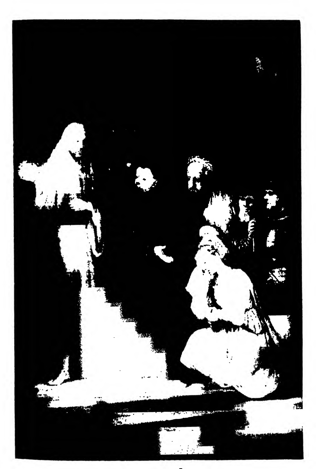
THE WOMAN TAKEN IN ADULTERY 1644. London, National Gallery