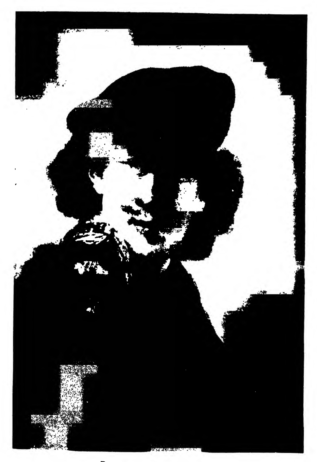
REMBRANDT-A SELF-PORTRAIT 1634. Berlin, Kaiser Friedrich Museum