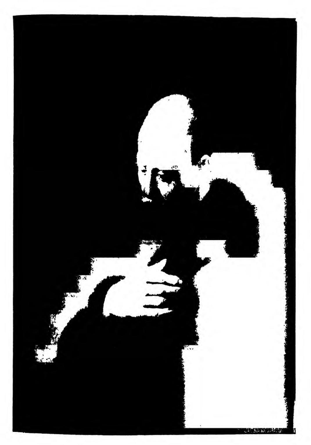
REMBRANDT'S FATHER Boston, Muscum of Fine Arts