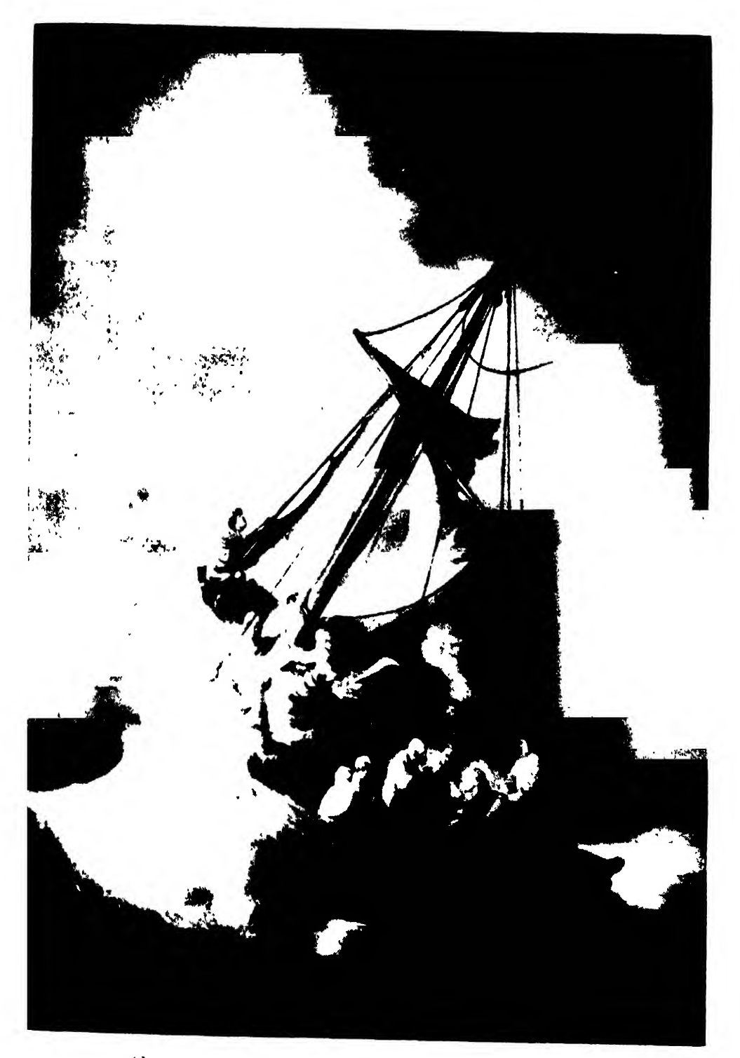
CHRIST IN THE STORM ON THE LAKE OF GALILEE 1033. Boston, Isabella Stewart Gardner Museum