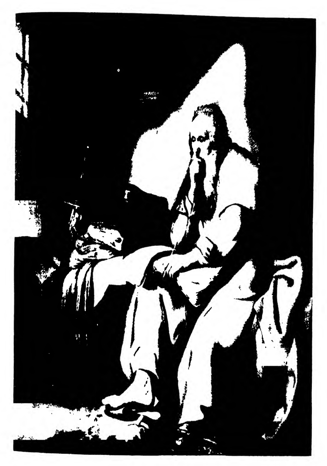
THE APOSTLE PAUL IN PRISON 1627. Stuttgart, Museum