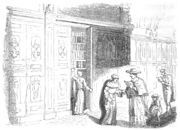
The interior of the Vatican Library