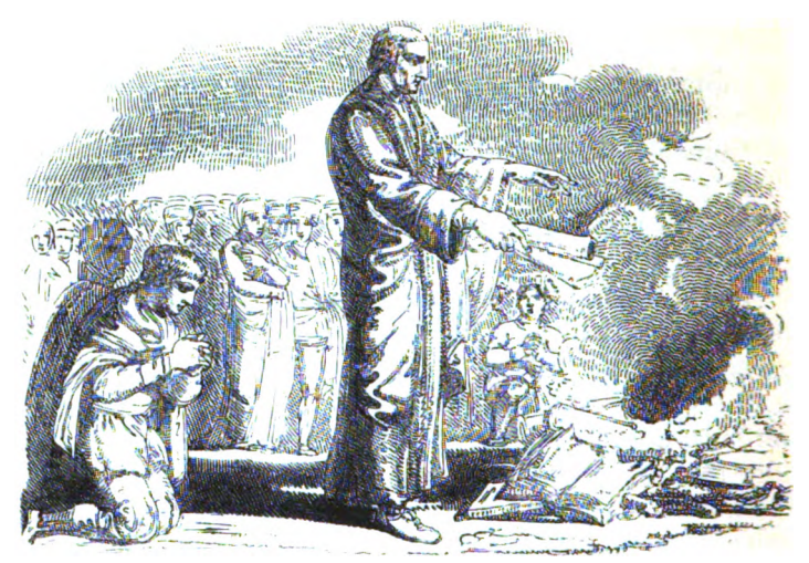
Luther publicly burns the bull of Leo X.