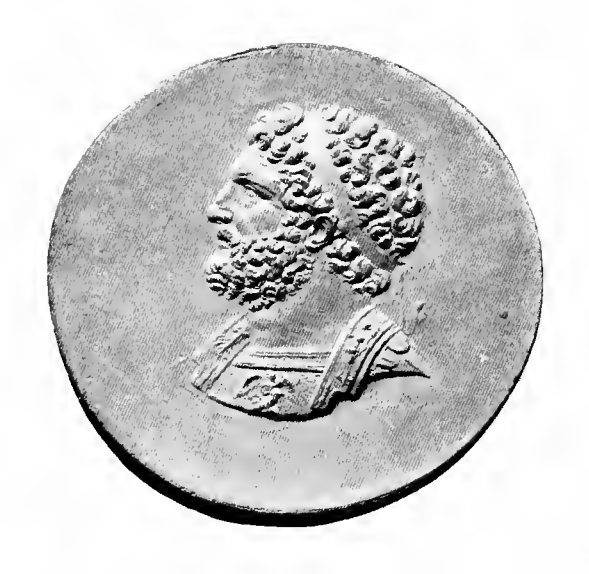
PHILIP Tarsus Medallion—Cabinet de France