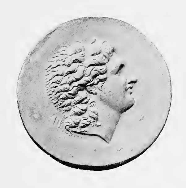
ALEXANDER IMMORTAL Tarsus Medallion—Cabinet de France