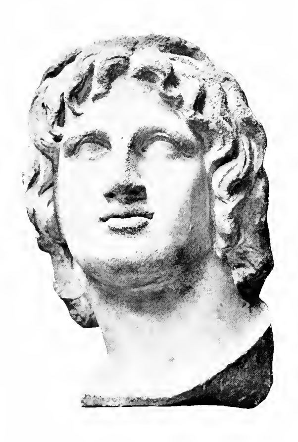
PORTRAIT BUST OF ALEXANDER in the British Museum