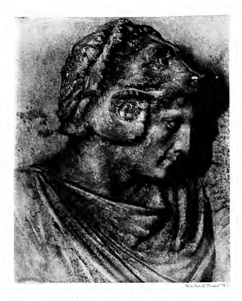
Alexander in Battle from the Sarcophagus of The Satraps at Constantinople.