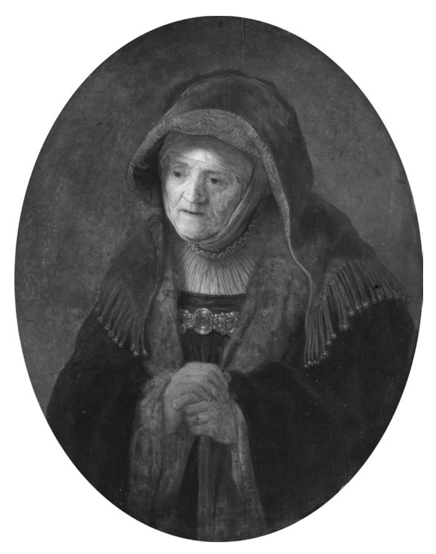
Figure 3. Rembrandt Harmensz van Rijn, Saint Anna (1639), Kunsthistorisches Museum, Vienna

or marble dimensions of the mystery of Incarnation – the import of gravity, the consequences of materiality for luminosity, 'apotheosis', a particular subject of Reformation Catholic art, and flight.