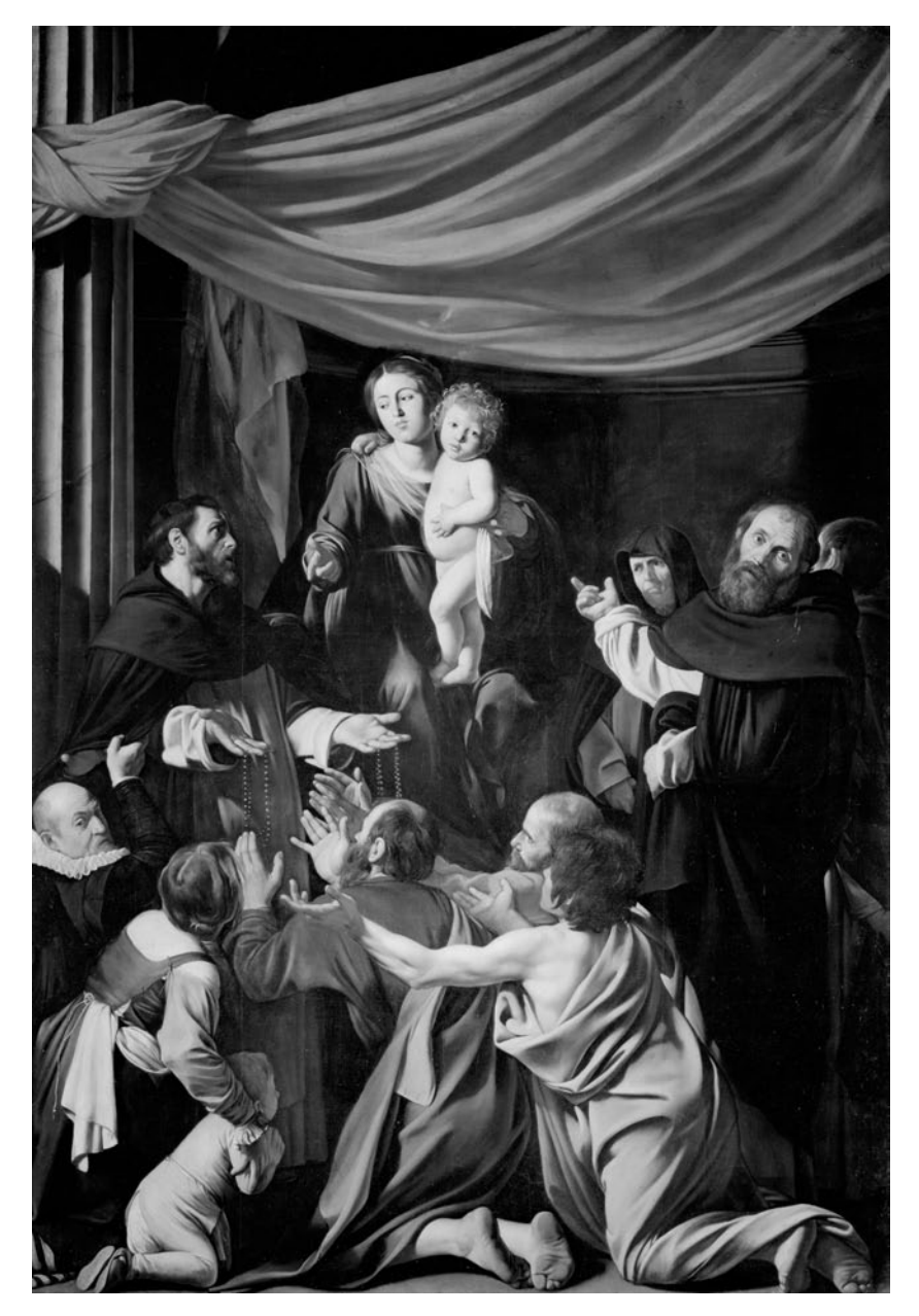
Figure 5. Michelangelo Merisi da Caravaggio, 'Madonna of the Rosary' (1606/7), Kunsthistorisches Museum, Vienna