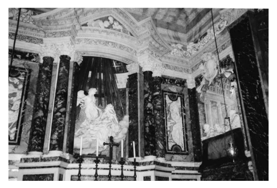
Figure 6. Gian Lorenzo Bernini, 'The Ecstasy of Saint Teresa', Cornaro Chapel, Rome

alludes to the connection mystics had made between ecstasy and death.<sup>29</sup> The placement of her transverberation over the altar links in marble and gold sacramental liturgy and saints and their cults.