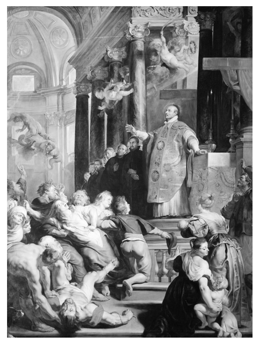
Figure 8. Peter Paul Rubens, 'The Miracles of Saint Ignatius of Loyola' (1615/16), Kunsthistorisches Museum, Vienna