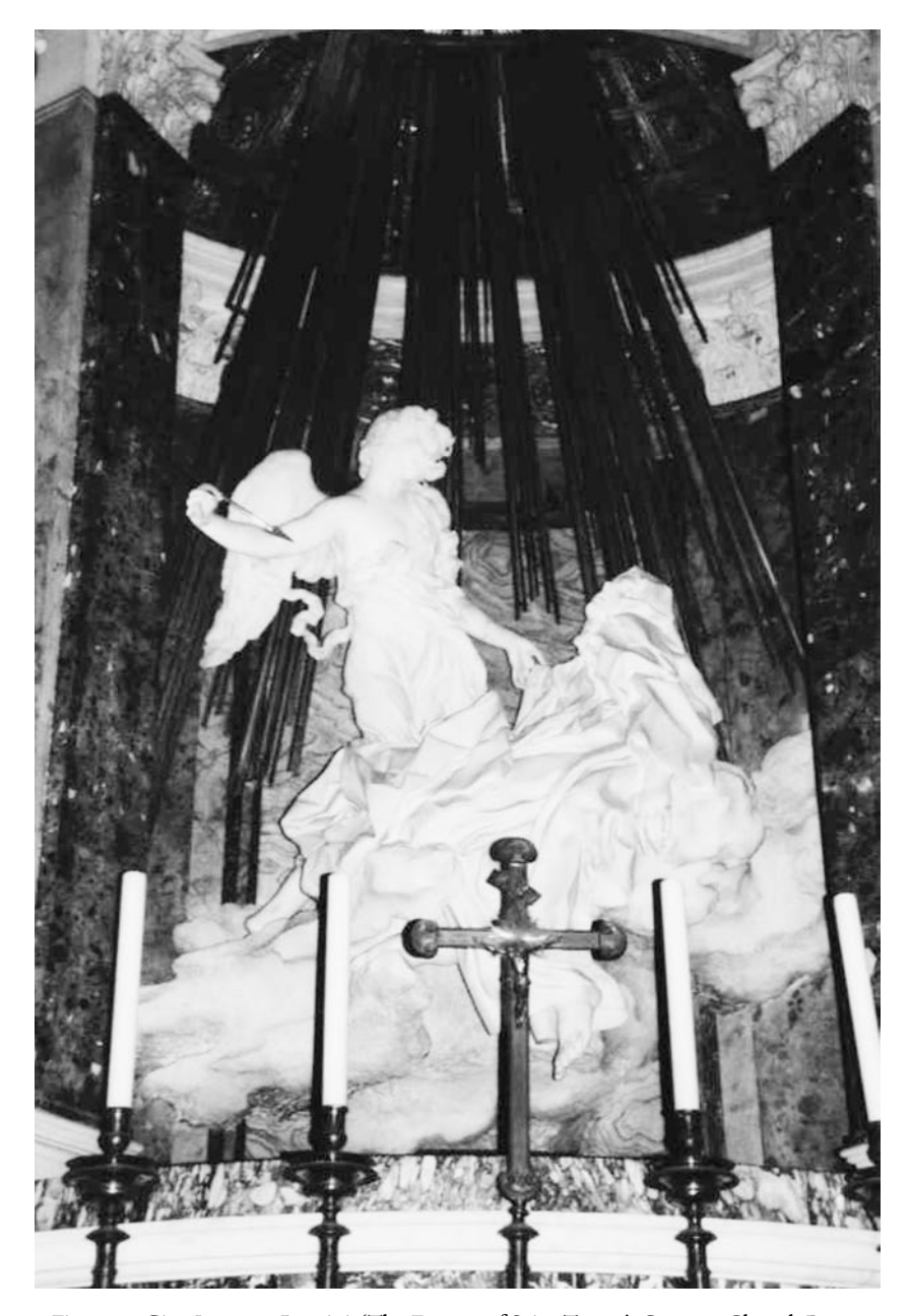
Figure 7. Gian Lorenzo Bernini, 'The Ecstasy of Saint Teresa', Cornaro Chapel, Rome