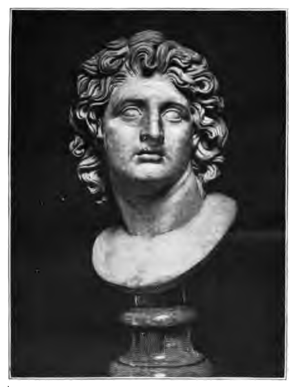
ALEXANDER THE GREAT Frontispiece—Greece, vol. eleven