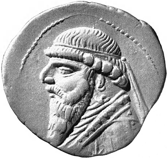
KING MITHRADATES II