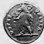
COIN OF HELENA, WIFE OF JULIAN.