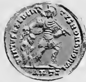
COIN OF JULIAN.