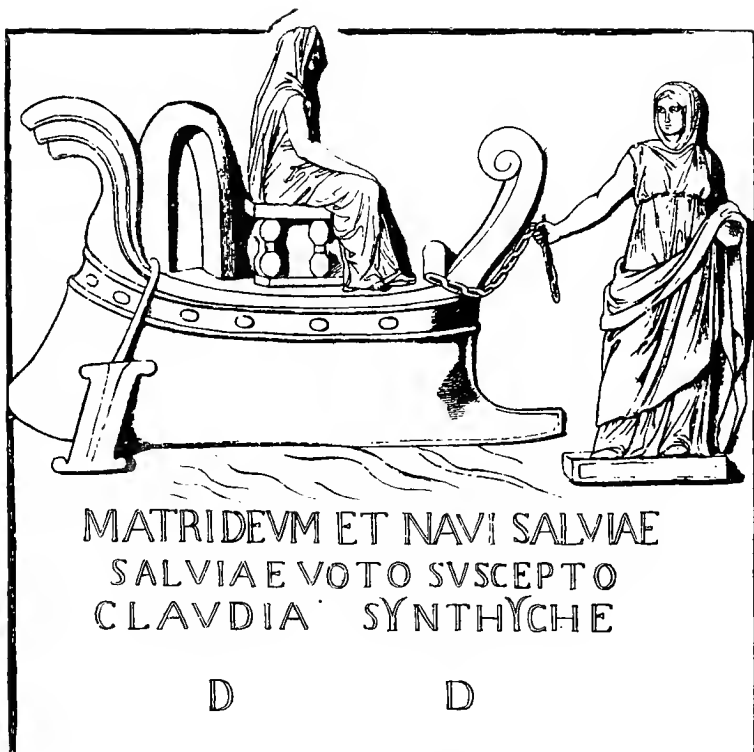
THE VIRGIN CLAUDIA DRAGGING THE VESSEL OF THE MOTHER OF THE GODS. (From a Terra-Cotta Relief.)