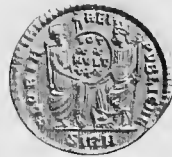
COIN OF CONSTANTIUS II.