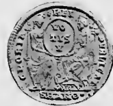
COIN OF CONSTANTIUS GALLUS, BROTHER OF JULIAN.