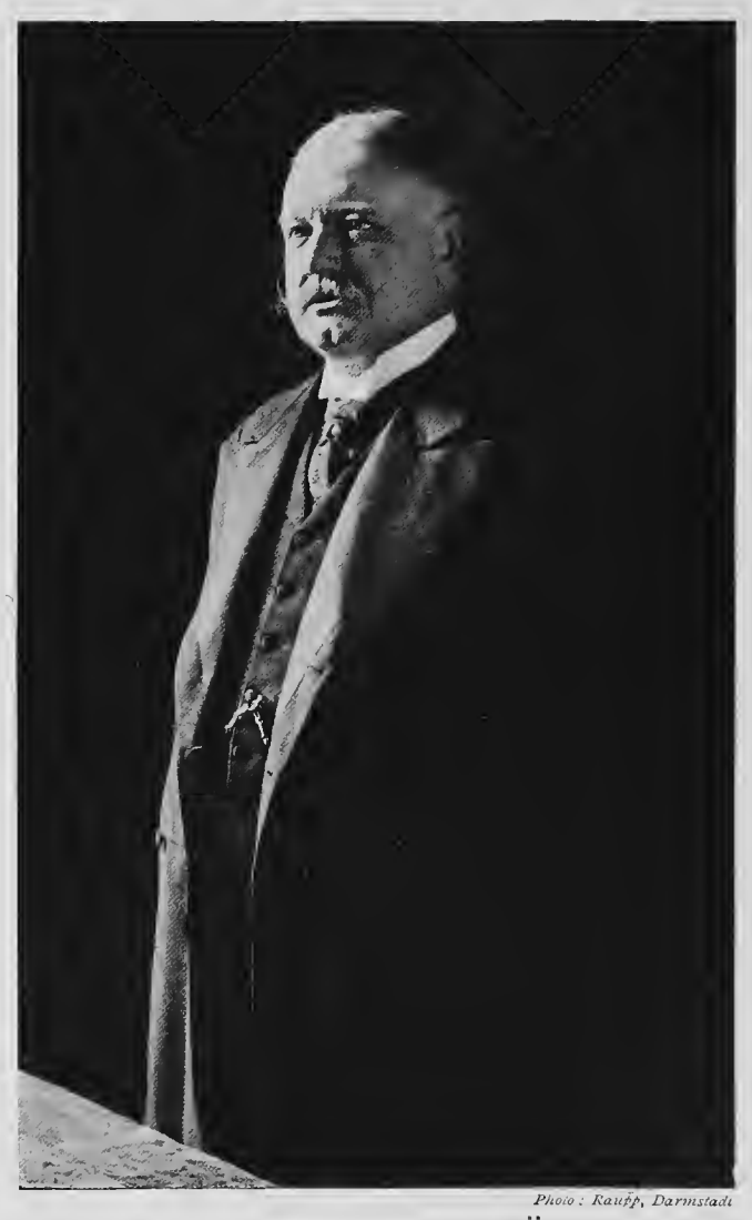
PRINCE BERNHARD VON BÜLOW