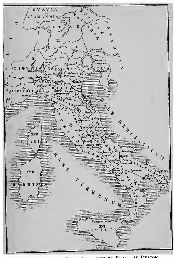
THE PROVINCES OF ITALY ACCORDING TO PAUL THE DEACON. Kiepert Neus Archiv. V, p. 104.